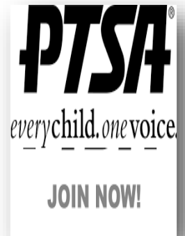
Photo below: Yuba Feather Preschool students model Wildcat T-shirts donated by our PTSA. Our Yuba Feather School PTSA does so much to support our school, families and communities. Won't you please consider becoming a member and joining today? Check out the Yuba Feather PTSA Facebook for information.